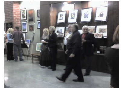
Art After Dark

The Guild meets monthly, alternating between second Tuesdays and Saturdays at the Columbia County Library. Tuesday meetings are held at 6:30 pm and Saturdays at 10 am. New members are welcome.