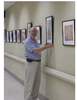
Medical College of Georgia

The Guild was established in 2004, and was initially launched by Columbia County Arts. In its first two years, the Guild has hosted ART IN THE BARN and ART AFTER DARK , scheduled exhibitions at various public venues and provided educational opportunities for our members. The Guild has also established a scholarship fund and has awarded $1000 in scholarship money to area high school graduates.