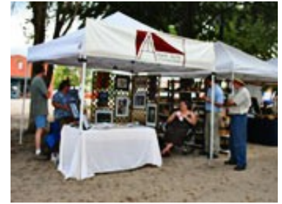
Arts in the Heart of Augusta

The Artists' Guild of Columbia County is a fast growing group of professional and amateur artists and patrons of the visual arts. Our artist members work in a variety of media including acrylic, ceramics, charcoal, collage, fiber arts, graphics, jewelry, metal art, oil, pastel, pen & ink, photography, pottery and watercolor. We have joined together to create an interest in the visual arts, to educate, and to encourage each other's work. The Guild provides opportunities for artists to exchange creative ideas and business information and offers projects of interest to artists and those interested in the arts.